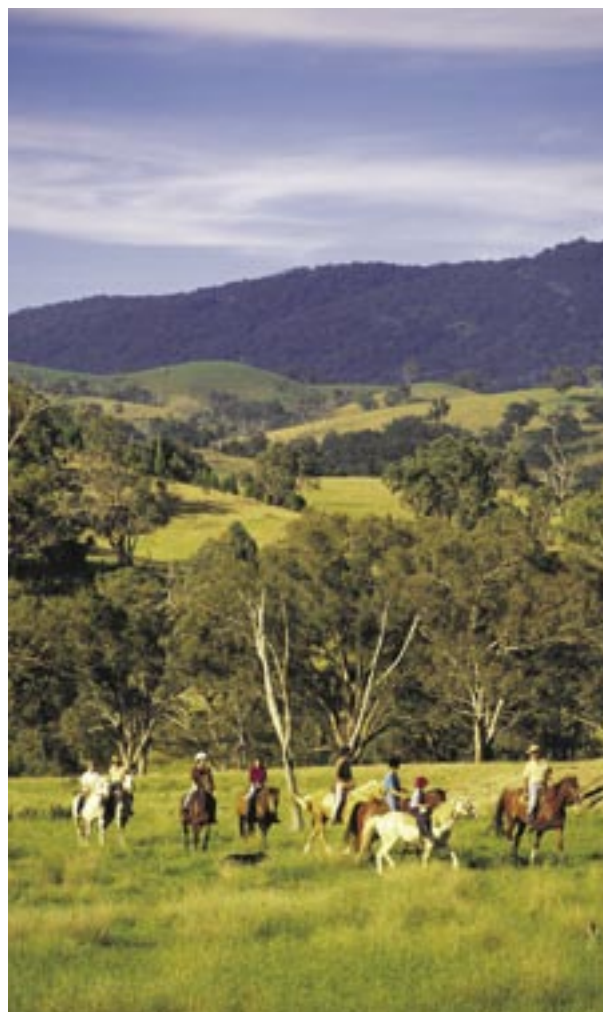
A bracing bush walk or a day of horse riding is a fun, cheap alternative to traditional schoolies activities on the Gold Coast.