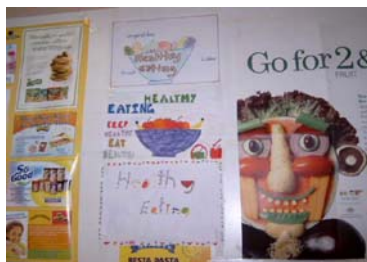
Some winning entries from the healthy foods colouring competition share the wall with other healthy eating posters

The canteen is frequently involved in health promoting activities. Last year for Healthy Bones Week, Susan provided a variety of fresh fruit, yoghurts and cheese sticks for students at the breakfast program. The canteen also ran a healthy foods colouring competition, where the entries were posted on the canteen walls and each winning entry received a canteen voucher.